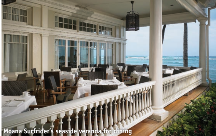
Moana Surfriider's seaside veranda for dining

Morning: Check out by noon and individual departures