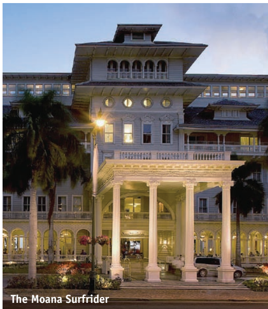
The Moana Surfrider

Brought to you by the Duke Alumni Association and the Nasher Museum of Art at Duke