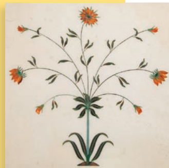
Wall and floor panels inlay commissioned by Doris Duke for Shangri La

Your home for seven nights will be the Moana Surfrider: A Westin Resort & Spa on Waikiki Beach . Often referred to as the "First Lady of Waikiki," this oceanfront Oahu hotel is a legendary landmark. Step into yesteryear, but with all the contemporary amenities and unique services to make this a memorable and enjoyable stay.