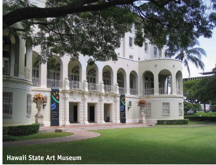
Hawaii State Art Museum

Afternoon: Hawaii State Art Museum. Experience Hawaii's story of culture, Asian roots, social consciousness,