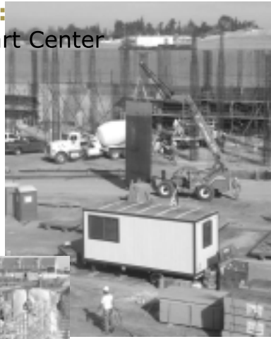
The walls are going UP!

and tours traveling throughout California and the West Coast.